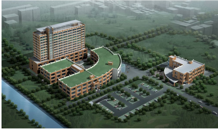
1 st Maternity and Infant Hospital of Tongji University

Photographs of the branch office and city where the branch is situated